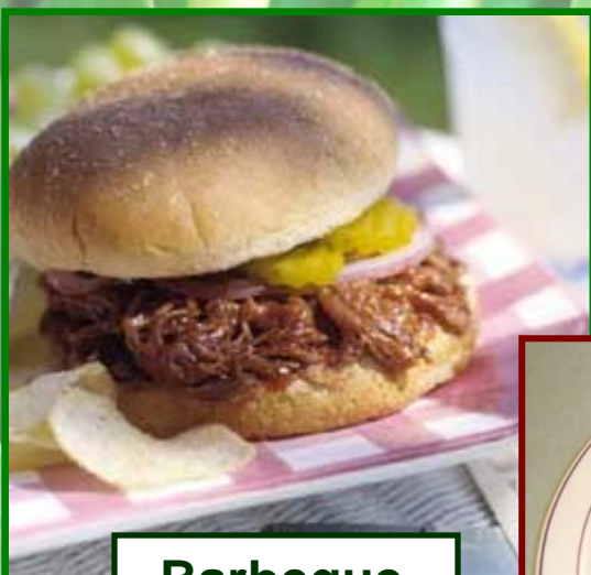
Barbeque Beef Sandwich